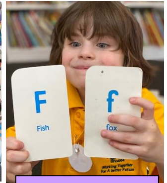
Willow Room 3 Matching letters

Some of our Foundation students from Room 3 with the work they have been very busy doing since they started at our school.