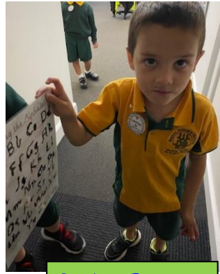
Lachlan Room 3 Writing